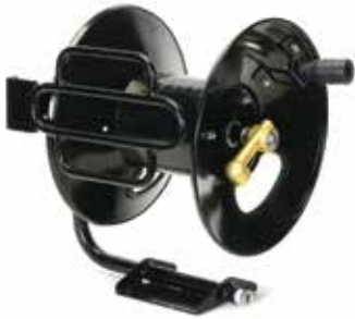
Fixed Base Hose Reel