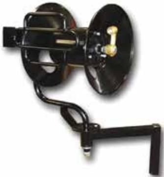
360° Pivot Reel