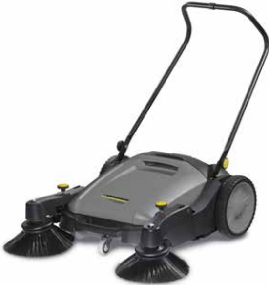
KM 70/20 C 2 B shown.