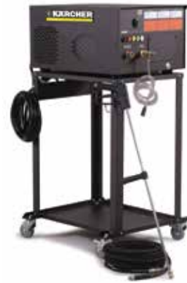
Floor stand with caster wheels