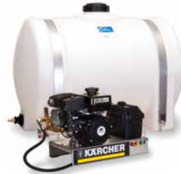
HD 2.5/27 P ST