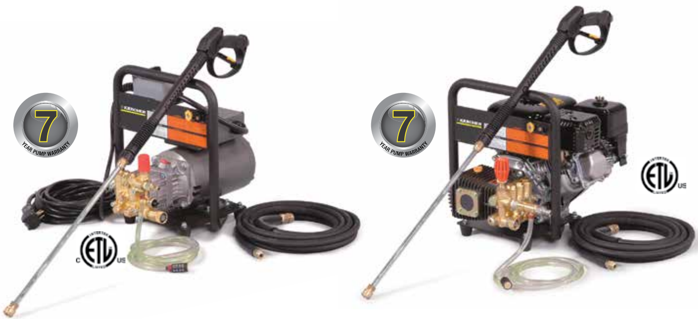
HD 2.0/10 Ed

These light-industrial hand held units are significantly more rugged than typical consumer substitutes and are built with durable steel frames. Hand-held models come with a dependable axial pump, high pressure hose, a stainless steel wand and detergent injector with brass soap nozzle.