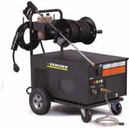
Wheel Kit with detergent rack and optional hose reel