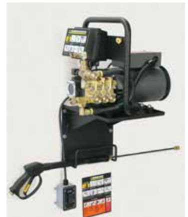
Shown with optional wall mount bracket

Kärcher's wall-mount unit has a durable steel frame, amazingly quiet 1725 RPM motor, and is perfect for in-shop uses. A remote on/off switch with a 10' electrical cord allows the machine to be mounted high on a wall away from backspray. ETL certified to UL and CSA safety standards.