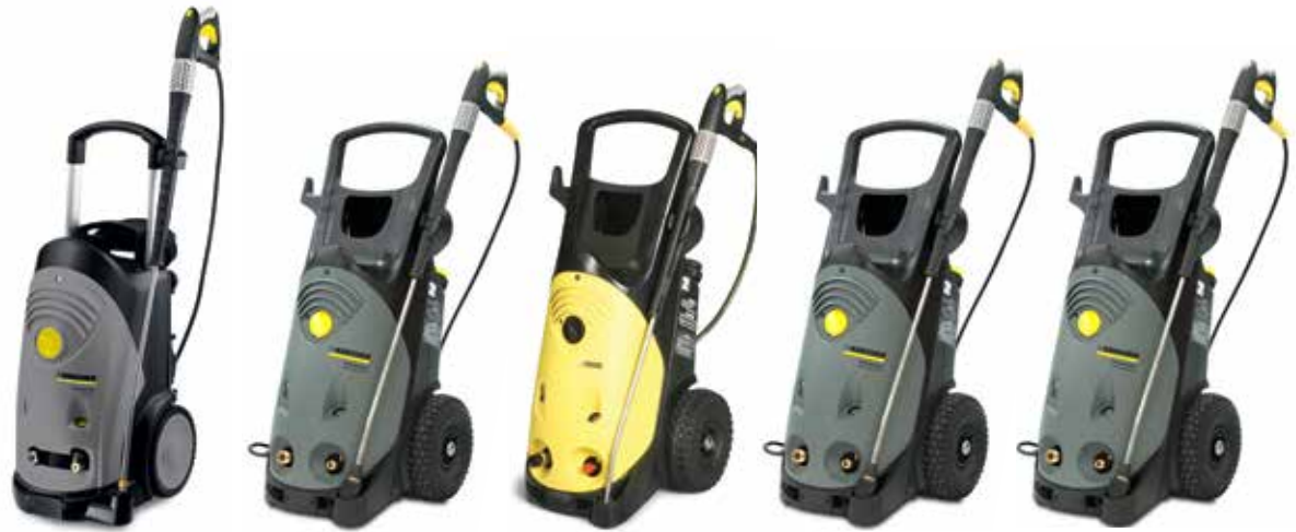
HD 3.0/20-4M Ea*