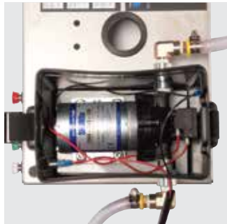
12V Booster Pump is protected in an all-weather box.

This versatile cold water mini skid is designed to easily mount to trailers and UTVs, allowing you ultimate portability and power in a cold water unit. Combined durability of the Subaru EX17 engine and Kärcher crankcase pump with U-Seal technology provides you dependability in the toughest conditions. Both units include a 100' high pressure hose that connect to a Professional-Duty gun and wand.