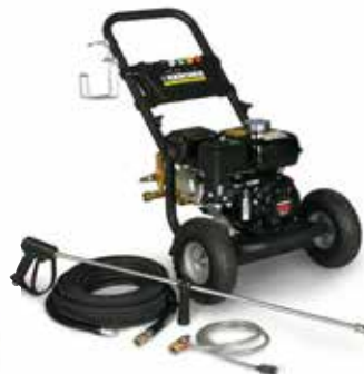
HD 2.3/23 P COM