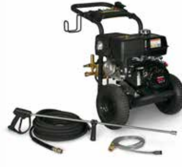
HD 3.8/35 P