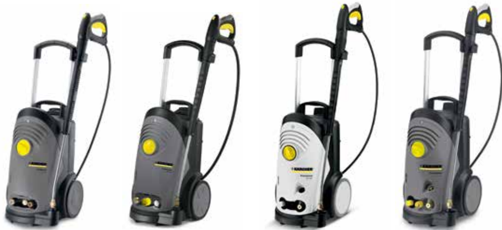
HD 1.8/13 C Ed*

Kärcher's Classic Series electric powered cold water units are compact, highly mobile and hard wearing. Built with high grade lightweight polypropylene and designed with usability and ergonomics in mind, these units feature patented direct drive Kärcher axial pumps with corrosion-resistant brass cylinder heads and protected by a 5-year warranty. They can deliver up to 4.5 GPM at 3200 PSI and are ETL certified to UL and CSA standards.