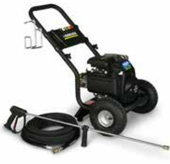
HD 2.3/23 PS KAR

Kärcher's Xpert series is a professional-grade line of cold water pressure washers. Powered by reliable Honda engines, Kärcher offers your choice of 160CC units with axial pumps or 196CC and 389CC units with Kärcher crankcase pumps. These Xpert units feature commercial-duty guns and wands and come with downstream chemical injection, four hardened stainless steel quick-couple nozzles and feature 25 or 50-ft of contractor-grade hose rated for 4,000 PSI. The precision welded frames and pneumatic tires make these pressure washers easy to maneuver on any terrain yet they are compact enough to fit in the trunk of most cars.